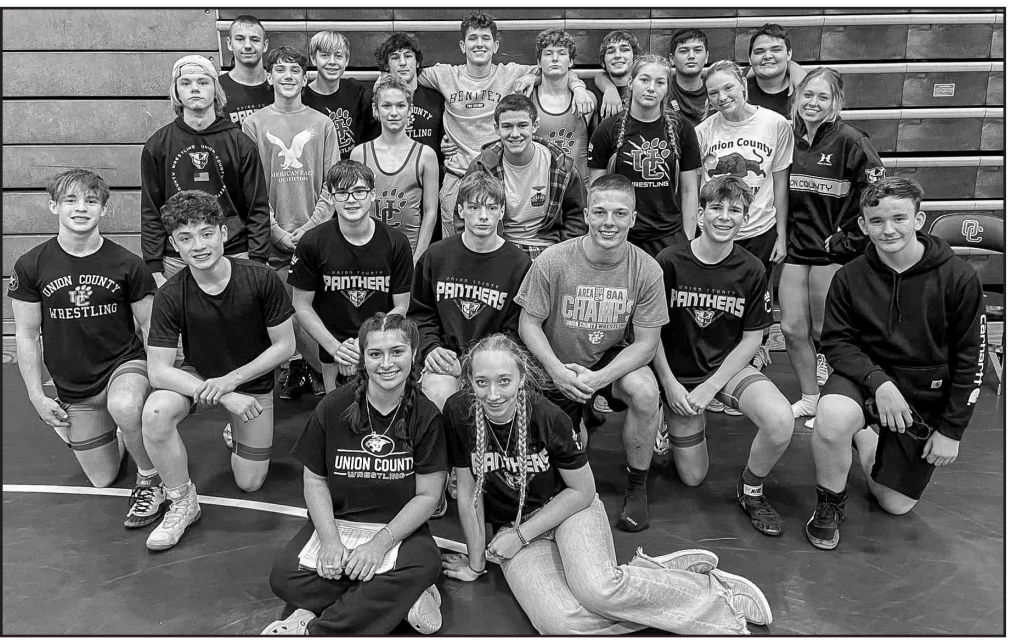
Union County wrestlers at Oconee County's Warrior Round Robin on Saturday. The Panthers went 3-2 at Oconee County despite missing some key wrestlers due to football. Union County defeated Oconee County, Harlem and Franklin County. The Panthers losses came to Elbert County and Hart County. Union County will wrestle at home on Tuesday, Nov. 19 at 6 p.m. The varsity, junior varsity and girls teams will all be in action.