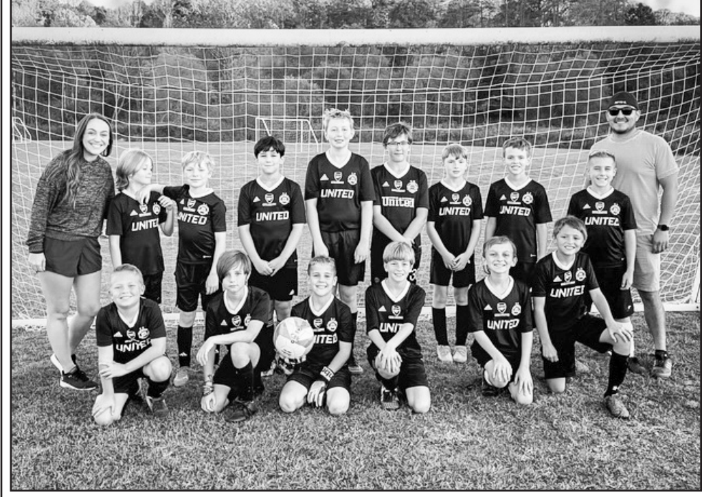
Union County's 12U soccer team finished with undefeated season -- scoring 80 goals and allowing less than 15. These boys are the definition of character and team play! Every single player, 14 in all, scored at least once this season, even the goalie and defensive line. This is all because they worked together and made sure to make opportunities for all their teammates.